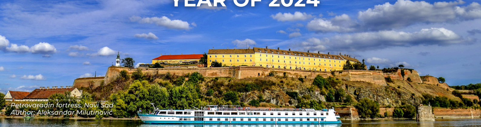
Petrovaradin fortress, Novi Sad

Saturday, October 26: Session II 10:45 – 12:15 (Room 3)