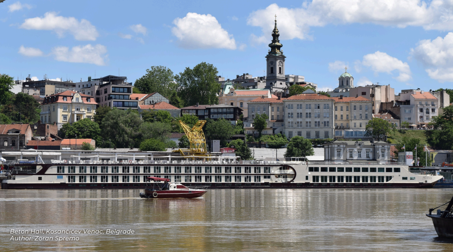
Beton Hall, Kosančičev Venac, Belgrade Author: Zoran Spremo