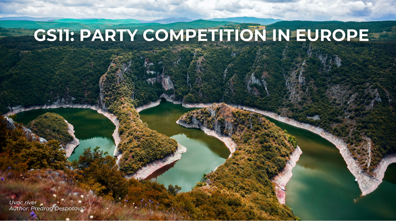
Uvac river

Saturday, October 26: Session III 15:00 – 16:30 (Room 2)