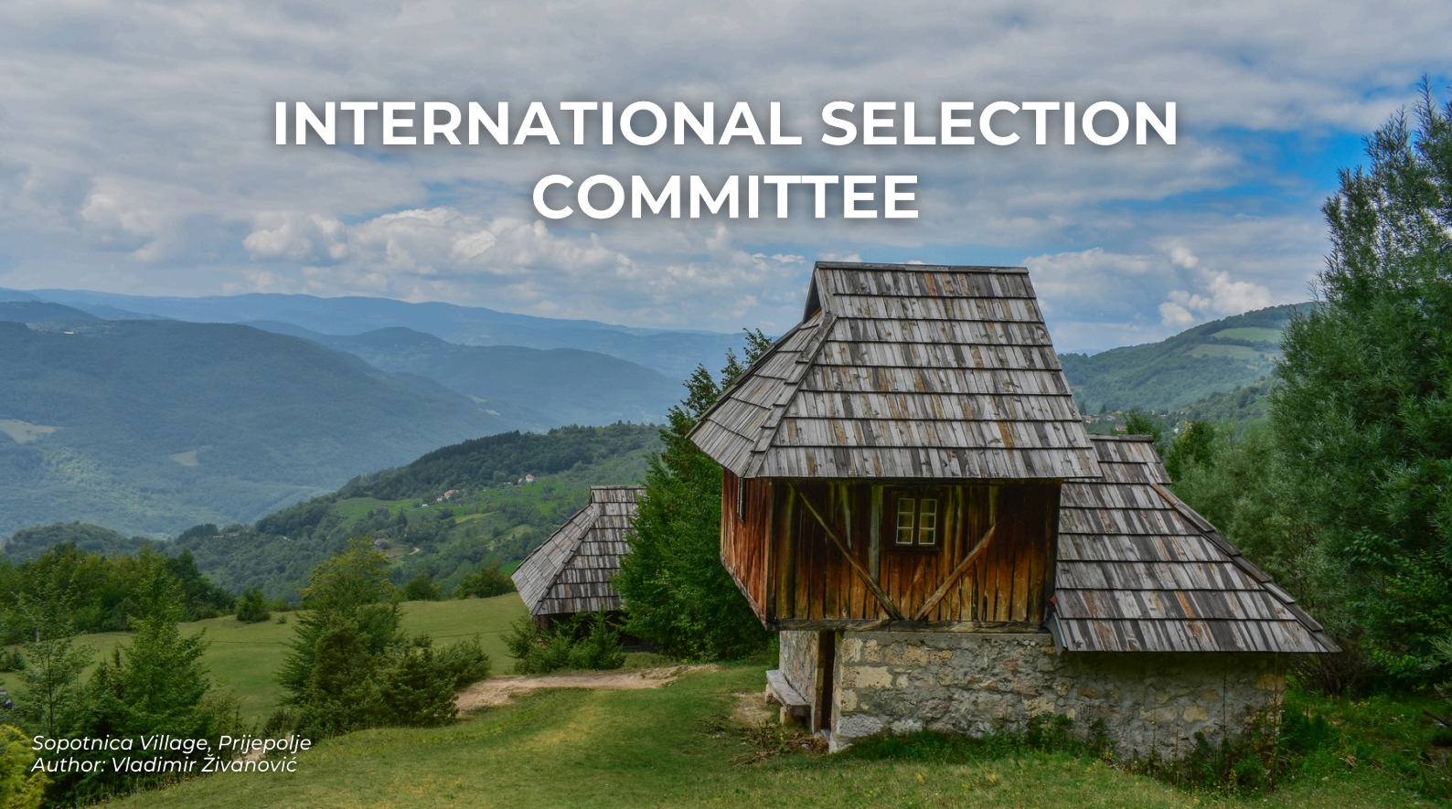
Sopotnica Village, Prijepolje