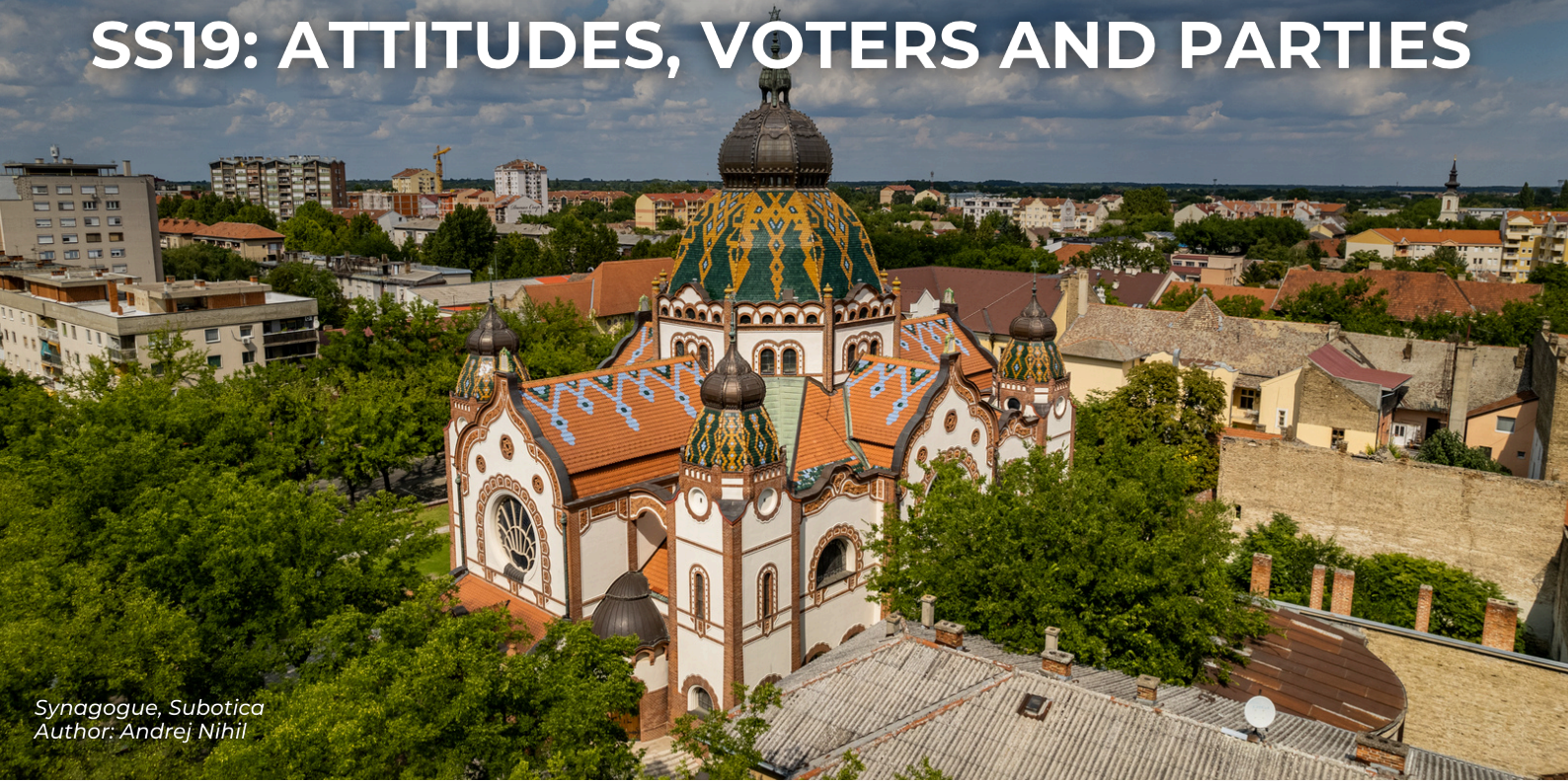
Synagogue, Subotica Author: Andrej Nihil

Sunday, October 27: Session VI 10:45 – 12:15 (Room 1)