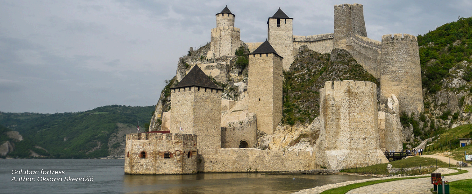
Golubac fortress Author: Oksana Skendžić

Saturday, October 26: Session II 10:45 – 12:15 (Room 2)