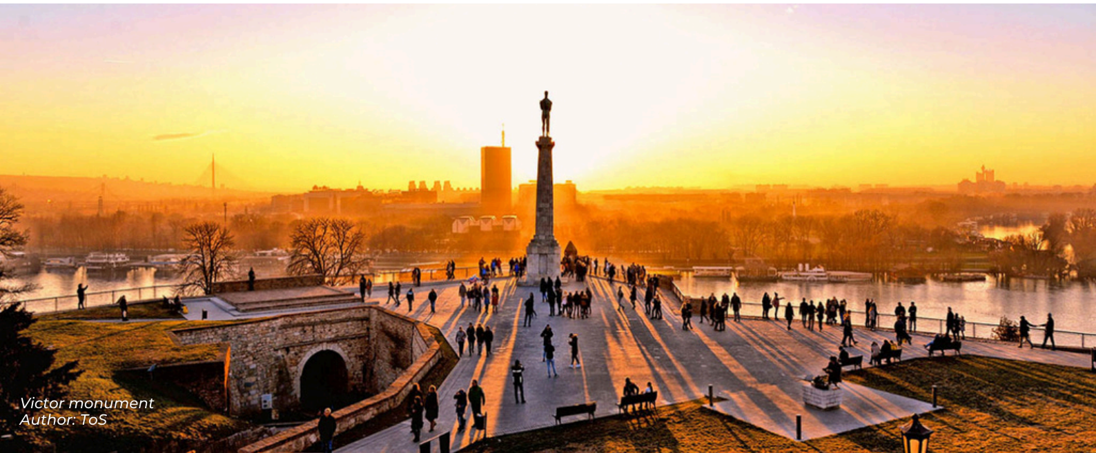
Victor monument

18. међународна годишња конференција Удружења за политичке науке Србије (УПНС)