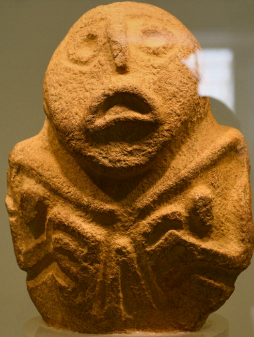
Lepenski vir, Donji Milanovac

Saturday, October 26: Session IV 16:45 – 18:15 (Room 2)