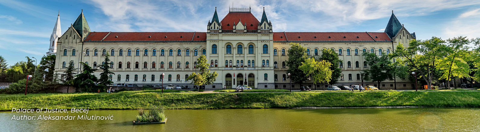
Palace of Justice, Bečej Author: Aleksandar Milutinović

Saturday, October 26: Session II 10:45 – 12:15 (Room 5)