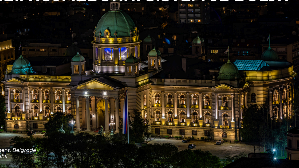
National Parliament, Belgrade

Sunday, October 27: Session VI 10:45 – 12:15 (Room 2)