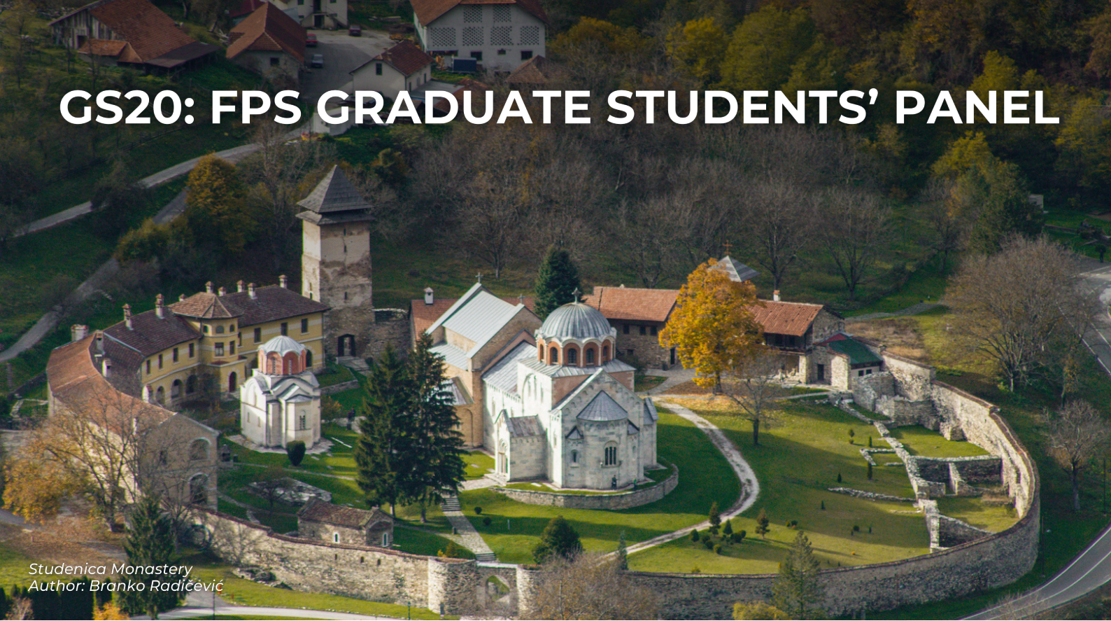
Studenica Monastery Author: Branko Radićević

Sunday, October 27: Session VI 10:45 – 12:15 (Room 3)