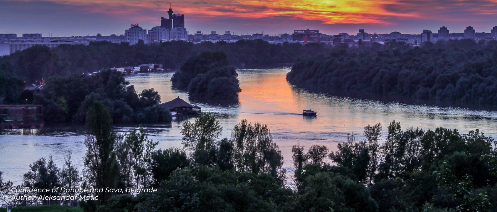
Confluence of Danube and Sava, Belgrade Author: Aleksandar Matic

Saturday, October 26: Session I 9:00 – 10:30 (Room 5)