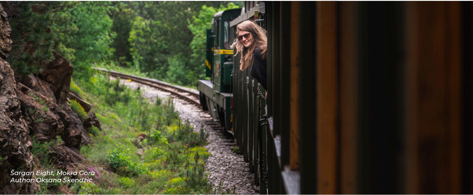
Šargan Eight, Mokra Gora

We would like to thank the Tourist Organization of Serbia for the photos.