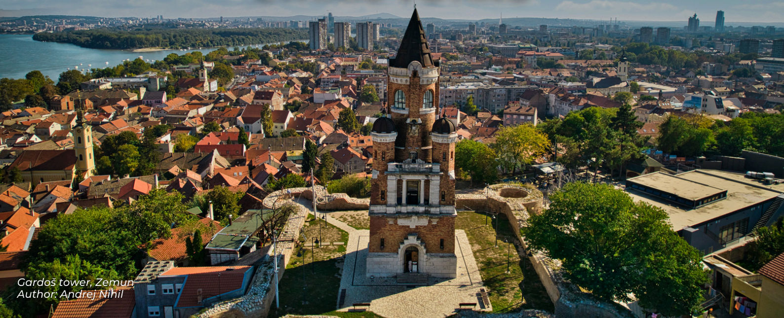
Gardoš tower, Zemun

Saturday, October 26: Session I 9:00 – 10:30 (Room 1)